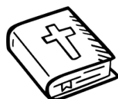
The Good News (vv.7-10, 17-21)

Hard and good news often go hand-in-hand in the Bible, as we see in the covenant God made with Abraham, and understanding this truth can help us navigate the delay between God's promises and their fulfillment